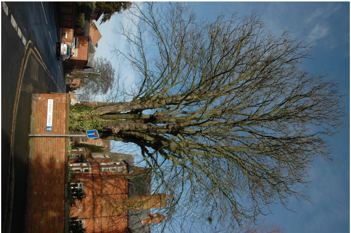
Trees in Loughborough.